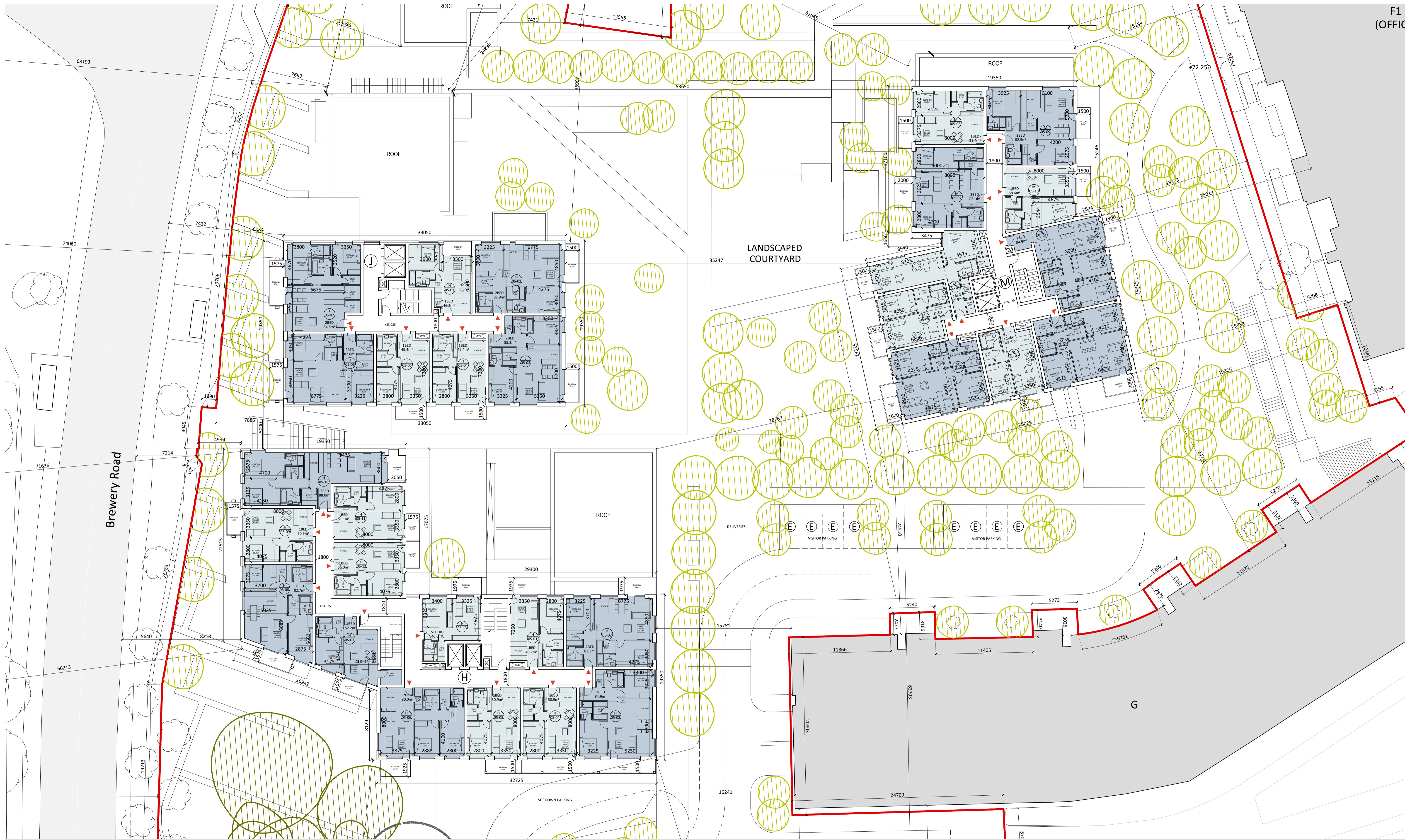
Blocks H, J & M Level 05 Plan